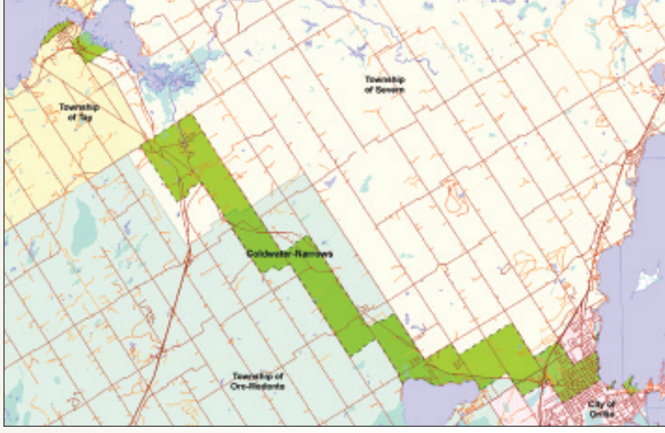
Figure 2 – Map of the Coldwater Narrows Reserve (green)

In 1830, the Lieutenant Governor of Upper Canada (Sir John Colborne) attempted to create a farming community for all three bands and established the 10,000 acre Coldwater Narrows Reserve. The Yellowhead and Snake bands settled in a village near the Narrows on Lake Simcoe, while the Aisance Band settled at Coldwater near Lake Huron. All three bands constructed a road between the two settlements (today this road is Ontario Highway 12). The road and the population explosion in Ontario at the time brought a lot of settler interest in the Coldwater Narrows area. In 1836, under very dubious circumstances, the Coldwater Narrows Reserve was surrendered.<sup>12</sup>