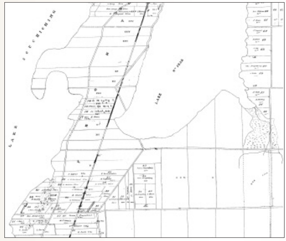
Figure 4 - Excerpt from Plan B495A, showing some of the purchased land in the Rama Township (1877)